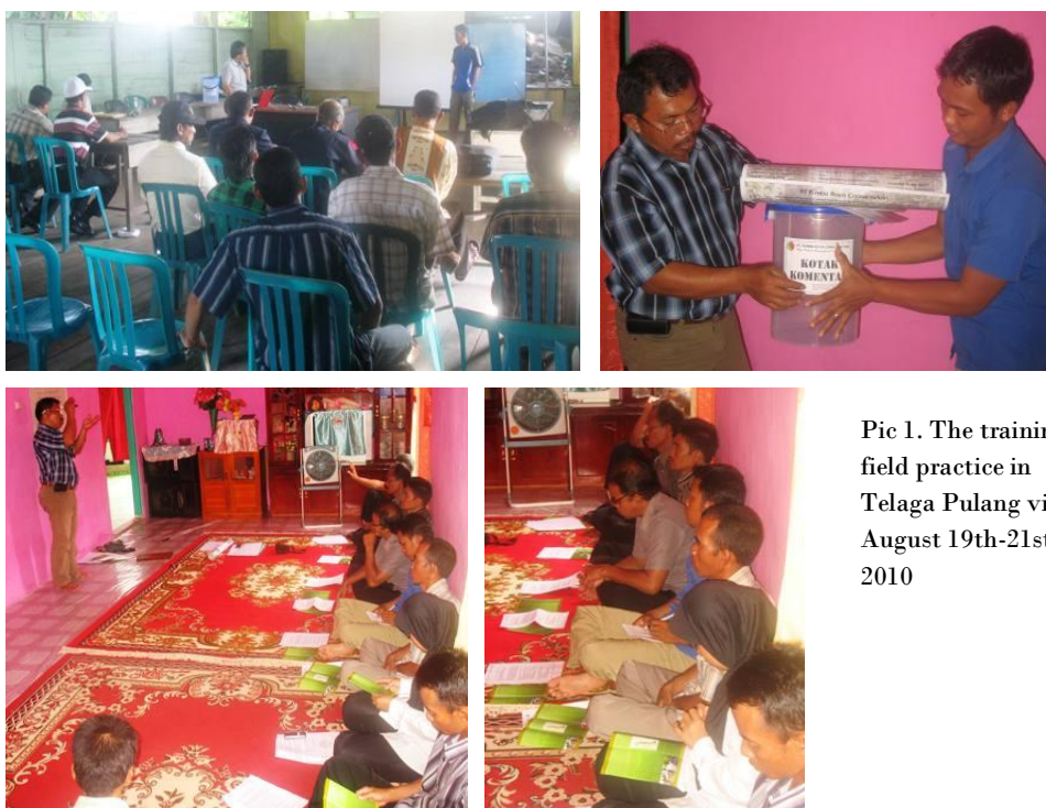
Pic 1. The training & field practice in Telaga Pulang village August 19th-21st 2010