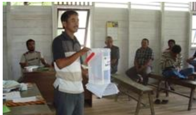
Pic 1. The FGDs and installing the boxes in Banua Usang Villages